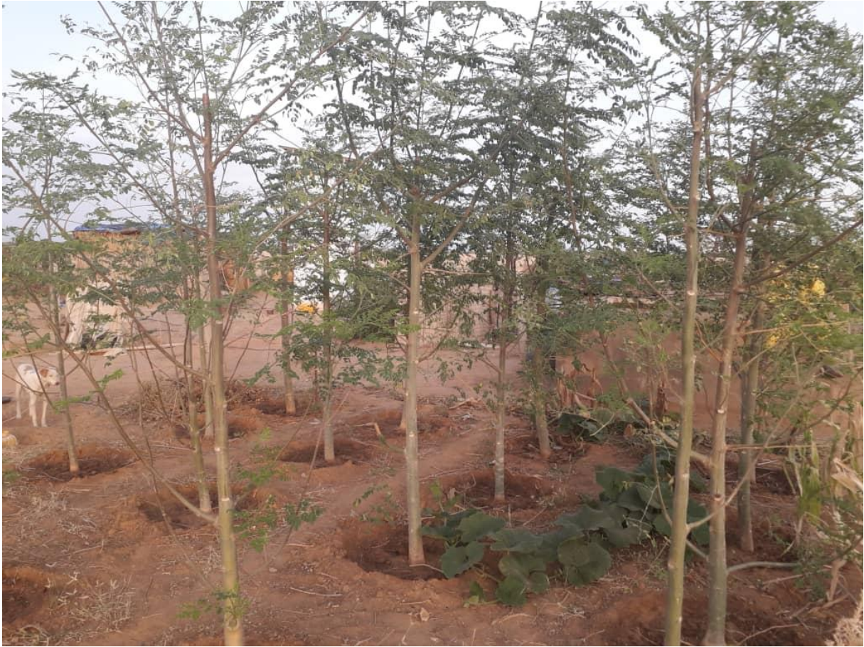
Moringa nursery near Thiangaye on the Senegal River