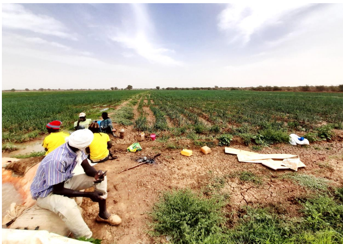
Irrigation via a branch of the Senegal River (onions, tomatoes, okra pods)

Creation of planting gardens of Moringa and Acacia melifera for fences, windbreaks and live hedges.