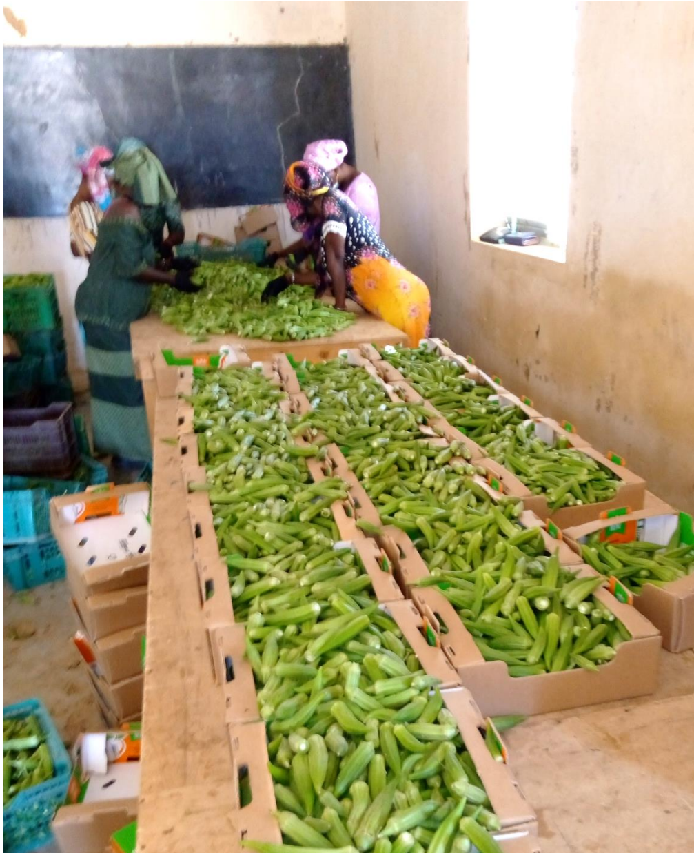
Harvesting, sorting and packaging of okra pods by the women's cooperative SODAGRITH