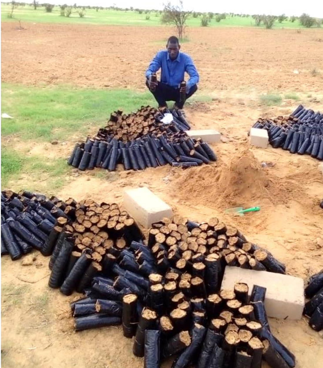
Tree nursery for afforestation for biodiversity